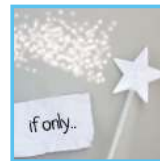
MY DREAM PHOTO

I COMMIT TO FULFILLING THIS DREAM. BY FULFILLING THIS DREAM, I HELP SHAPE THE FUTURE.